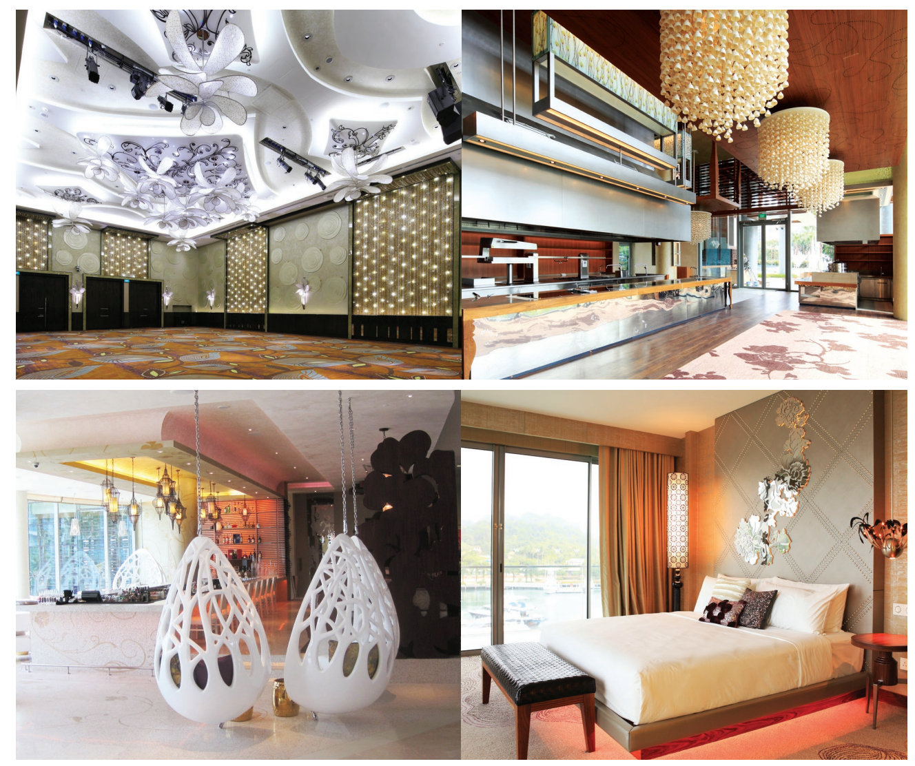
Banquet Hall (Top-Left), Restaurant (Top-Right), Lobby (Bottom-Left), & Hotel (Bottom-Right)